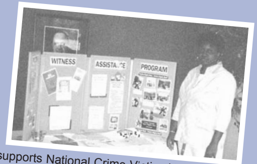
MHA supports National Crime Victims' Rights Week with exhibit from the Office of the District Attorney