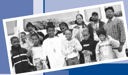
Residents, young and old, participate in Cherry Blossom's Fishing Rodeo