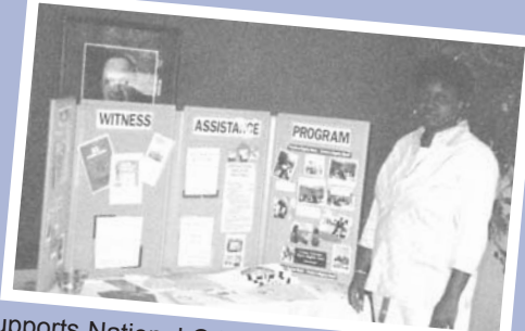
MHA supports National Crime Victims' Rights Week with exhibit from the Office of the District Attorney